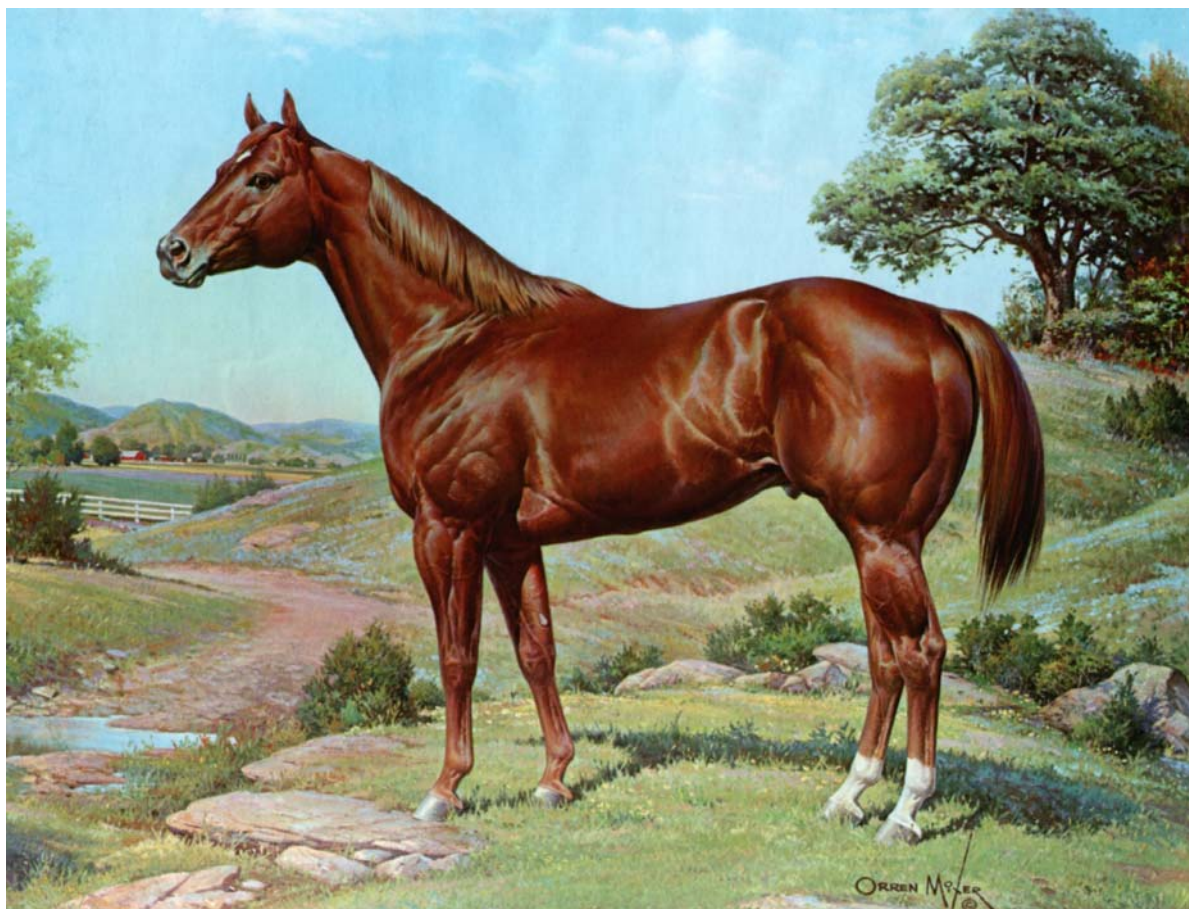
The American Quarter Horse